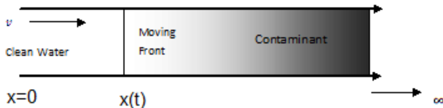
Figure (1): Conceptual model used in this study.

The problem considered in this work was conceptualized as shown in Figure (1). A semi-infinite one-dimensional homogenous saturated soil system was contaminated with a single component soluble organic material. The organic material exhibits three different