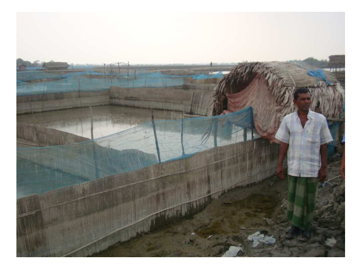
Fig. (2): Mud crab fattening in earthen pond