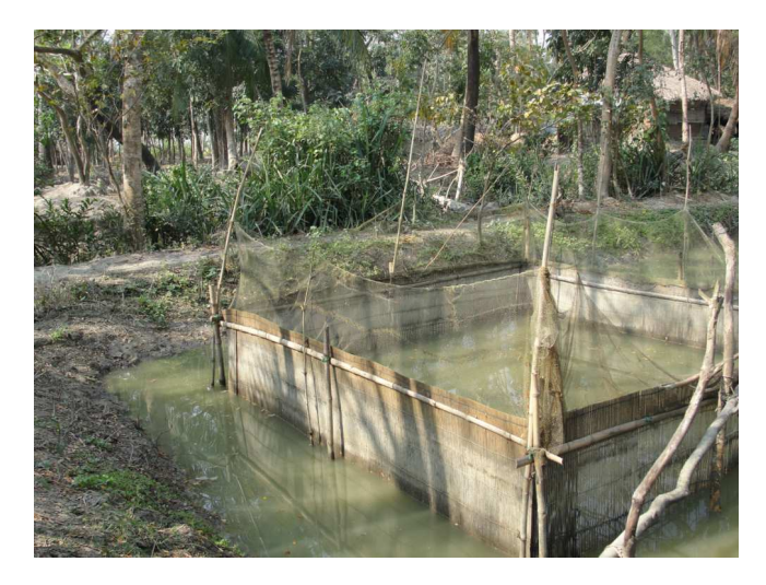
Fig. (3): Mud crab fattening in gher

Most of the crab farmers (about 77%) do fatten only mixed sex crabs in their pens and others cultivate fishes (e.g. Oreochromis sp., Pangasius sp., Setipinn a sp., Lates calcarifer, Liza parsia ,