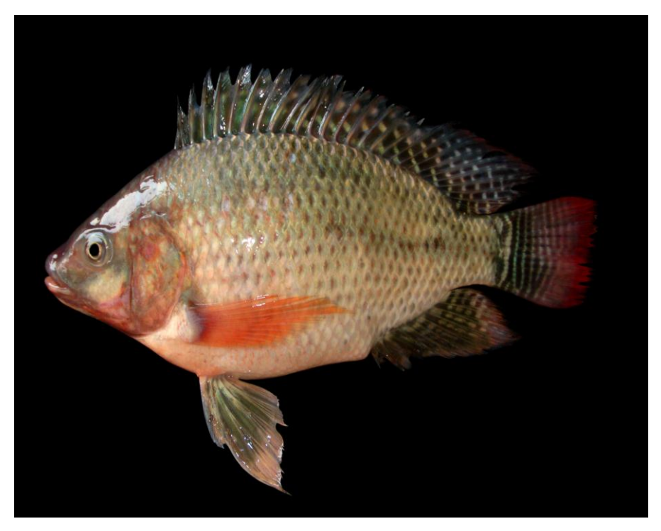
Figure 2. General body shape of O. niloticus from Shatt Al-Arab River.

and soft ray parts of the dorsal fin is continuous. The dorsal fin contains 17-18 spines and 12-13 soft rays. The anal fin contains 3 spines and 9 rays (Table 1). The colour of pectoral, dorsal and caudal fins is reddish. Total length ranged from 192-292 mm. Body depth ranged from 43.03-45.96 % of standard length, head length 32.51-34.23, snout length 11.47-12.78. The caudal peduncle depth was close to the caudal peduncle length (Table 2).