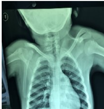
Figure 2: Anteroposterior radiography. This radiography shows left Sprengel's deformity with prominent superior angle of the scapula in the web of the neck.