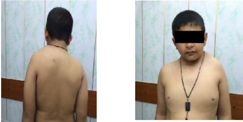
Figure 1: Photograph of the patient's body at 10 years of age. Congenital elevation of the left shoulder (Sprengel's deformity) apparent deformity is approximately severe and repair with surgery is needed.