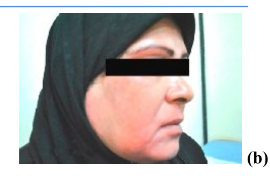
Figure 2 (a) Diffuse erythema before treatment. (b) The skin lesion resolved after the end of treatment