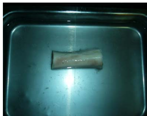
Figure (2): Bovine femoral cortical bone model show the site after final preparation.

Bovine femoral cortical frozen until used. The bone was placed in a thermostat-controlled bath containing physiologic saline at 37°C (K type thermoelectric couple 830c, 837, 838 made in Taiwan and KI&BNT digital thermometer) were used to measure temperature. Site preparation began when the temperature of the bone, reached a temperature of 37^{\circ} \pm 1^{\circ}\text{C} . Sequential drilling was accomplished following system manufacturer's recommendations. The sites of preparation have been done on the bovine femoral cortical bone.