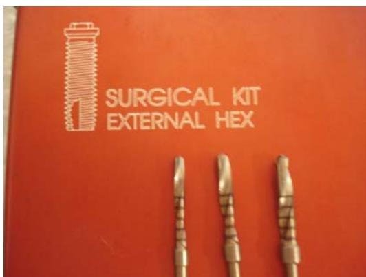
Figure(1): The drills of ELIT implant systems that are used in implant site preparation only first and second one used (3.25, 3.75mm).