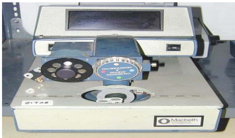
Figure (3): The densitometer device.

While I_t , represents the current intensity in the mA of the light passed through of exposure. D: represents the optical density on that small area which was a measure of the degree of blackness of that area. The error in measurement of any optical density by densitometer or thermopile equal to \pm 0.01 experimentally.