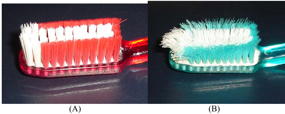
Figure (2): Toothbrush Appearance after (A) One Month, (B) Three Months.

●●● significant difference from previous measurement at p < 0.001 , ●● p < 0.01