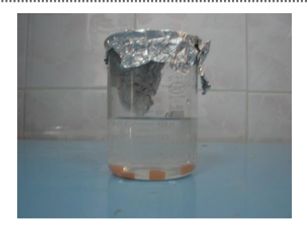
Figure (2): A beaker containing group W specimens immersed in 200 ml of sterile distilled water to be microwaved.

Accordingly, after incubation of all the soft lining material specimens for 24 hours at 37°C, 40 specimens were selected for microwaving (20 specimens were undergone dry irradiation and 20 specimens were undergone wet irradiation) and the last 20 specimens were not microwaved (positive controls). The tubes containing positive control specimens (group C) were got vortex vigorously (Tucker instruments LTD/ England) for 1 minute and allowed to stand for 9 minutes, followed by a short vortex to resuspend and organisms present.<sup>(21)</sup> To determine the number of microorganisms in the 10<sup>-5</sup> and 10<sup>-6</sup> dilutions replicate specimens (100 µl) of the suspension were transferred to plates of 3 selective media, Nutrient agar media for Staph. aureus and B. subtilis, Mueller Hinton for Ps. aeruginosa and sabouraud agar