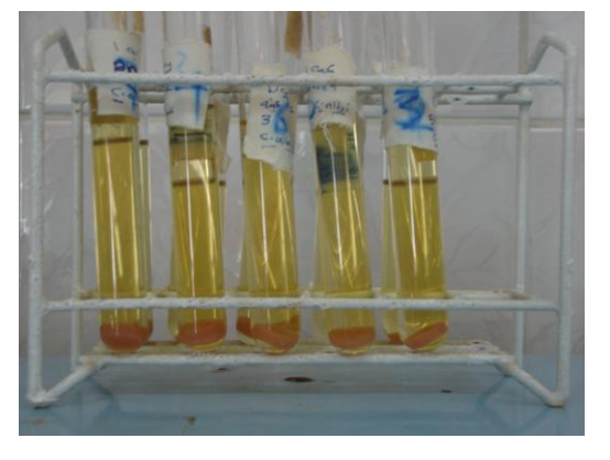
Figure (1): Test tubes containing specimens in (BHI) broth after 48 hours incubation to verify sterility; no growth was observed.

to 10 ml of Brain Heart Infusion Broth (Oxoid) in sterile test tubes, which were then incubated at 37°C for 7 days. At 48 hours and 7 day, the broths were evaluated for microbial growth (turbidity). No turbidity in the broth tubes was observed at 48 hours and 7 days (Figure 1).