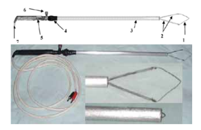
Figure 2: Laparoscopic thermocautery tool (9). 1. Thermal wire; 2. the two movable arms (length, 7 cm) for holding of thermal wire; 3. outer body (metallic tube with an outer diameter 10 mm); 4. rubber valve to prevent gas escape; 5. internal movable part. 6. on/off switch; 7. source of continuous electrical current (12V, 12 A).