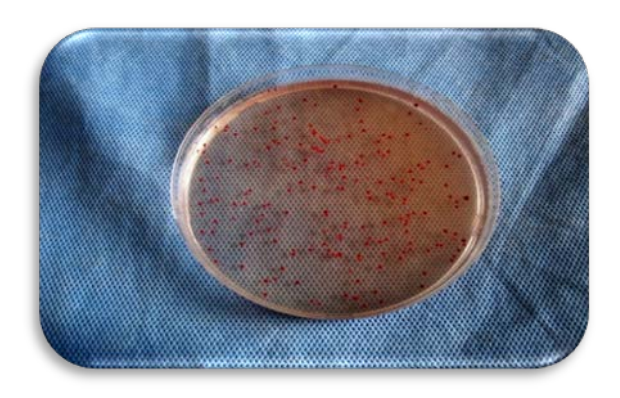
Figure (2): Petri dishe with Enterococcus faecalis growth of control positive.

5. Canal irrigation: After 24hours incubation of the samples, each experimental canal was treated by injection 10 \mu L of freshly prepared corresponding solution and left for 5 minutes and then each canal was dried with sterilized paper point, group D was not treated with any solution to consider as control negative then bacterial samples were taken from the samples of 4 groups using size 40 sterilized file which was inserted to full canal length, then the file is rotated 360 degrees in clock wise direction for dentin engagement. The file was inserted inside the