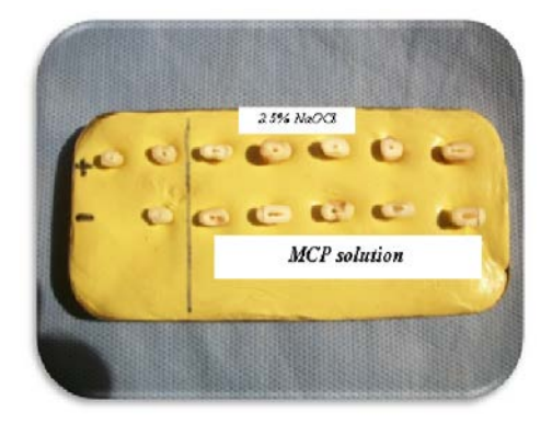
Figure (1): Samples of extracted teeth after decoronation fixed in heavy body impression material.

2.Sterilization of teeth: The apical foramen of each root sample was sealed by applying acrylic resin on the apical 3mm of root to prevent fluid leakage during microbiological work. Each root was embedded in silicon impression material block up to 2 mm of cervical margin Figure (1)