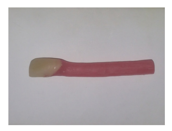
Figure (1): Sample of tooth for shearbond

preparation were made using carbide fissure bur. After that 5mm end of the wax