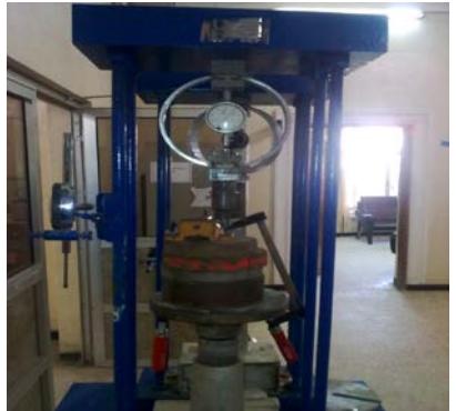
Figure (3): Universal testing machine(Instron)

All samples soaked in three different disinfectant solutions( acetic acid, NaCl and chlorohexidine ) half hour per day for three periods of time (1 week, 1month and three months). The testing performed on a Universal testing machine (Instron) and the samples were holded by using the device holder (clamp) as shown in Figure (3) .The load at fracture was recorded.<sup>(9)</sup> Statistically mean and standard deviation ANOVA, Duncan's were calculated. multiple range test and Post Hoc Tests were carried out to determine the significant differences among tested groups at p \le 0.01 .