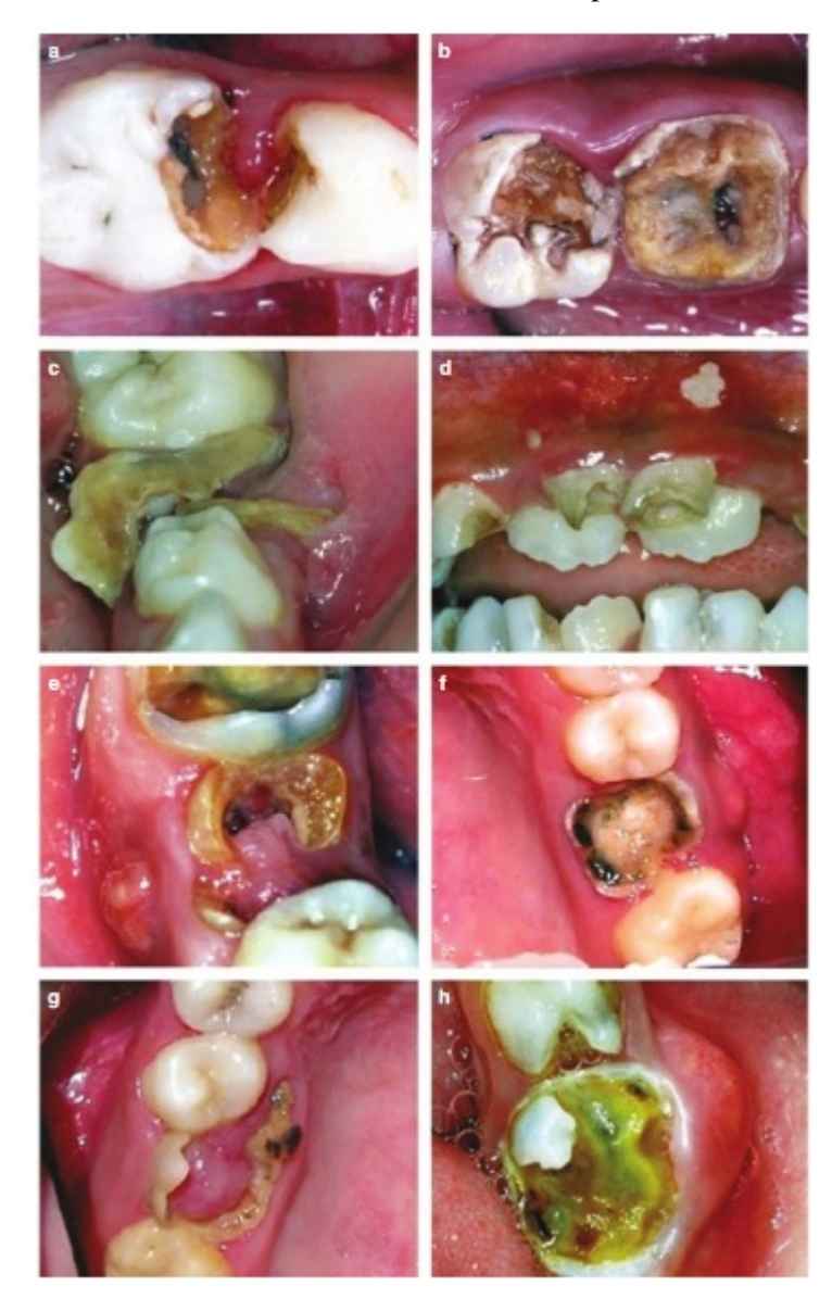
Figure (1): <sup>(4)</sup>(a, b) Pulpal involvement (P/p), (c, d) Ulceration (U/u), (e, f) Fistula (F/f), (g, h) Abscess (A/a).

Data were analyzed using Statistical Package for Social Sciences (IBM SPSS) Data Entry software version 19.0, and descriptive statistics were conducted as means and standard deviations, frequencies and percentages. The "Untreated Caries, PUFA Ratio" was calculatedas:<sup>(4)</sup> [(PUFA+pufa)/(D+d)]×100