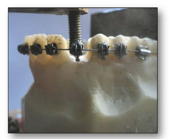
Figure(2): "c" configuration elastic ligatures used with Synergy brackets

tion that keep the wire in the lumen slot and avoid pushing the arch-wire against the bottom of the slot, thus leading to reduced friction that play a critical role on the level of the deactivation force ^{(4)} , the deactivation force as mentioned previously is of more clinical interest, because it more closely approximates the forces that cause tooth movement during orthodontic treatment <sup>(3)</sup>, consequently as the method by which the arch wire is ligated to the bracket can significantly affect friction<sup>(8-12)</sup> it affect the deactivation force .With c ligation method the friction was reduced by increasing amount of wire between brackets and not full engagement of arch wire to slot of brackets was occurred ( keep wire in lumen slot and avoid pushing the arch wire against bottom of slot ) as shown in (Figure 2). This increases the flexibility of wire and reduces or eliminates the ligation forces (frictional forces).<sup>(4)</sup>