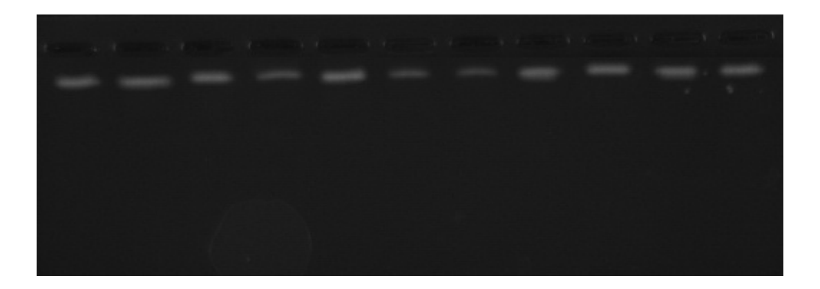
Figure (1): 0.8 % Agarose Gel Electrophoresis of 11 strains of P.multocida genomic DNA Bands . All Lanes = Positive Samples (presence of DNA).

The whole bacterial DNA was isolated from suspected P. multocida colonies and its concentration was determined to be greater than 100ng/\mu l using for each samples. On the other hand, the agarose gel electrophoresis was carried out to check the quality and purity of the extracted DNA. The bands of extracted DNA were observed on the gel as shown in figure (1).The agarose gel electrophoresis showed clearly that DNA does not undergo any degradation during extraction.