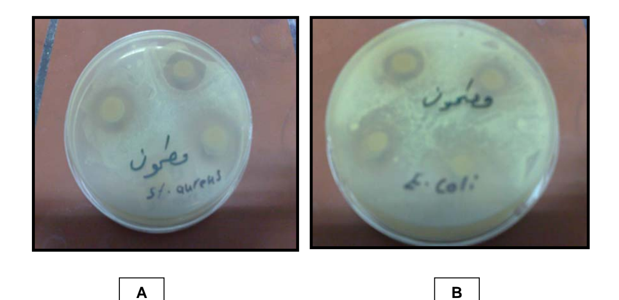
Figure(2): The inhibition zone of the isolated bacteria using Syzygium aromaticum as grinded A:S.aureus B: E.coli