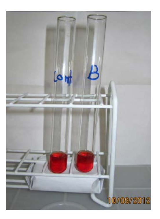
Figure (5): The cytotoxicity test of flavonoid compound B3