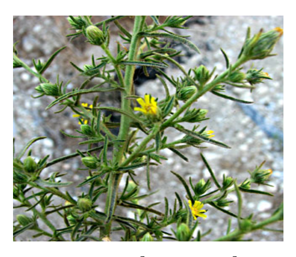
Figure (1) : Inula greaveolens L.

The Inula graveolens L. plant used in this study, was collected in august 2011 from the Abu-Al-Khaseeb region (Southern Basrah), Iraq. The plant was botanically authenticated and 3897 voucher specimens were deposited in the Herbarium of Basrah (Iraq, Basrah, College of Science, University of Basrah).