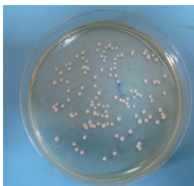
Figure (1):Colony Morphology of Candida

Identification of Candida was performed by the following diagnostic laboratory tests: (Culture characteristics): On Sabouraud' Dextrose Agar medium within (24-48) hrs at 37°C, Candida species produce soft creamy colored colonies with a yeast odor. (13, 14) (Figure 1).