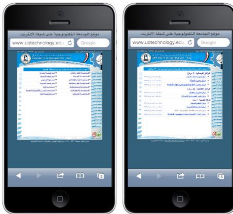
Figure (4) Mobile UOT's Department and Center Pages.