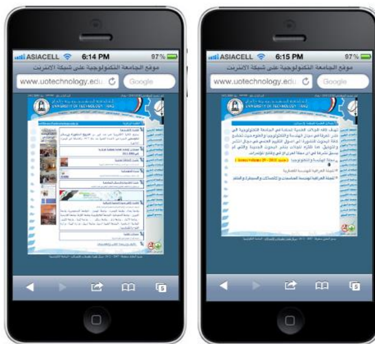
Figure (5) Mobile UOT's Central Library Page and Scientific Magazine Page.