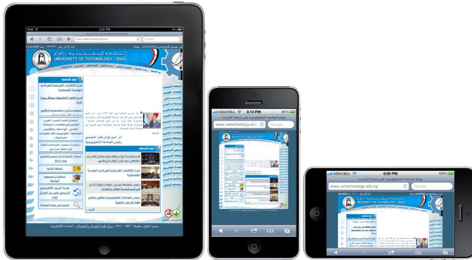
Figure (3) Mobile UOT's Home Page Shown using iPad and iPhone.