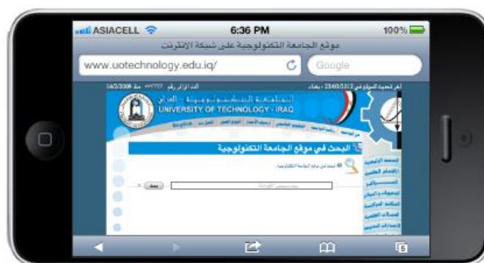
Figure (6) Mobile UOT's Search Page.