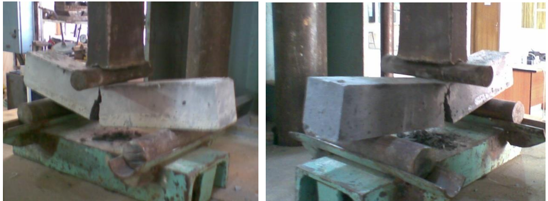
a-0% steel fiber

Flexural specimen failed at plane approximately in the middle of the specimen. The addition of steel fiber gives a monition to failure by appearance of crack in the tension face of specimen before the failure happened, while the specimen without steel fiber failed suddenly. Fig.(4) show the flexure specimen after tested, at different fiber volume percentage.