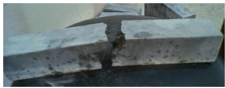
c- 2% steel fiber