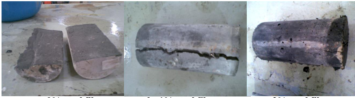
a- 0% steel fiber

An indirect test of tensile strength of concrete has been standardized by ASTM C 496-96 [13] and is in general use in this tests specimen of cylindrical shape of diameter 100 mm and 200 mm inlength are tested under a compressive load across the diameter along its length till the cylinder splits. To determine the average split tensile strength, in the present work, 3 cylinders of each mix are tested under compression testing machine of 180tones capacity after removing the specimens at the age of 28 days from the curing tank. Cylindrical specimen is placed in the machine, along its length, keeping plywood strip between the cylinder and the testing machine bearing surfaces at the top and bottom of cylinder. Load is gradually applied and maximum load at which the specimen fails is noted. The magnitude of the tensile strength is worked out with the help of 2P/\pi LD . Where P is applied load at failure, D is the diameter in mm and L is the length of specimen in mm. Fig.(3) show the splitting failure of the tested specimen with 0%, 1% and 2% of steel fiber.