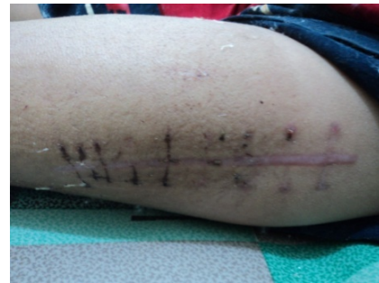
Figure 5. Fourth post- operative weeks

Till the fourth post-operative weeks, the course was uncomplicated, X-ray of left femur showed evidence of mild callus (figure 5, 6) and with thigh splint allowing for ambulation with crutches, with partial weight bearing on his left lower extremity