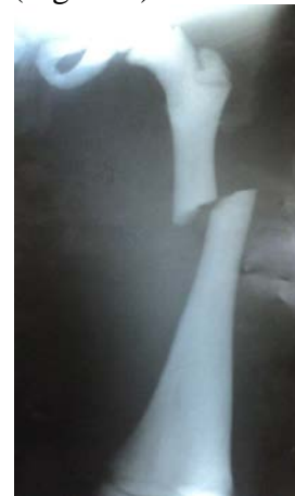
Figure 2. X-ray of left femur

X-ray of left femur showed short oblique fracture of upper third with abnormal increased bone density, metaphyseal widening and no differentiation between the cortex and the medulla giving chalk like appearance (Figure 2).