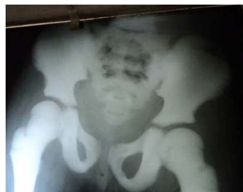
Figure 3. X-ray of pelvis showing generalized bone sclerosis

Skeletal survey reveals generalized bone sclerosis affecting the skull, spine, pelvis and appendicular bones. (Figures 3)