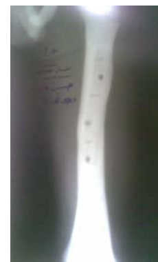
Figure 7. After removal plate and screws

Unfortunately, after that the patient was lost for follow up until Jun 13, 2011 (i.e. more than one year) he came with clinical and radiological signs of complete bony union. The patient admitted and the plate and screws removed without problem (fig. 7).