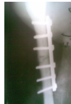
Figure 6. Fourth post-operative week clean wound incision

Unfortunately, after that the patient was lost for follow up until Jun 13, 2011 (i.e. more than one year) he came with clinical and radiological signs of complete bony union. The patient admitted and the plate and screws removed without problem (fig. 7).