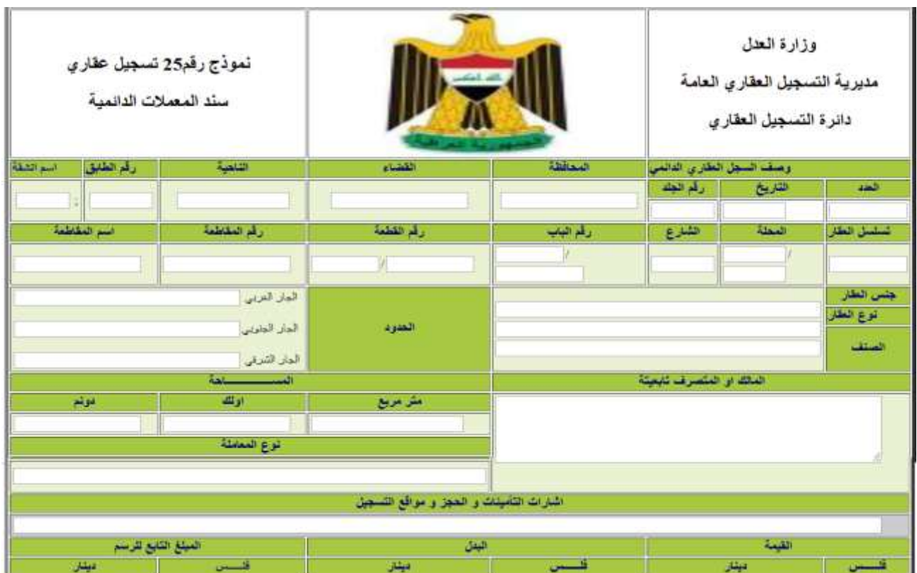
Figure (5) the Prototpe No. 25 's Page

Figure (4) represent the five employee's levels mentioned in section 5 and there Authentication's, example the manager has the authority to display the information that already stored at the database and the other employee's authority as shown above.