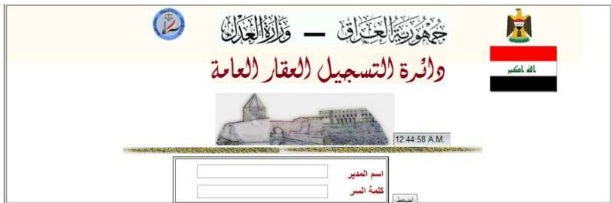
Figure (3) the Manager login page

At the beginning the manger start activating the system “login the system” using its own the user name and the password, Figure (3) shows the manger login interface.