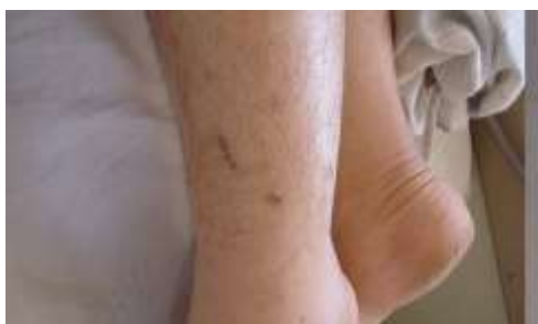
Figure 4: Multi lesional score DD with kobner phenomena