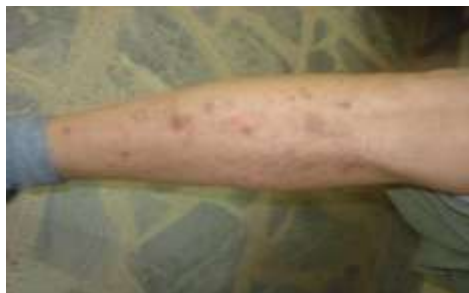
Figure 3 : Multilesional score of DD on the shin of 56 years old male with DM.