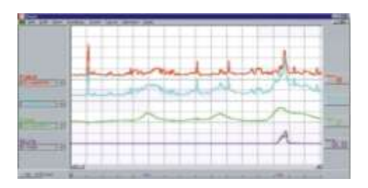
Figure 1: Detrusor overactivity as shown by cystometry.

Following the 8-week treatment with Oxybutynin, only 4 of 25 (16%) had detrusor overactivity. This marked a statistically significant difference (p<0.001) before and after treatment Table 6.