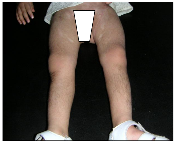
Figure 6. Photograph for same female patient with profuse distribution of the hair with extension around both legs.