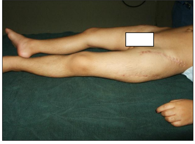
Figure 4. Photograph for female patient 5 months later, hair started to change to normal.