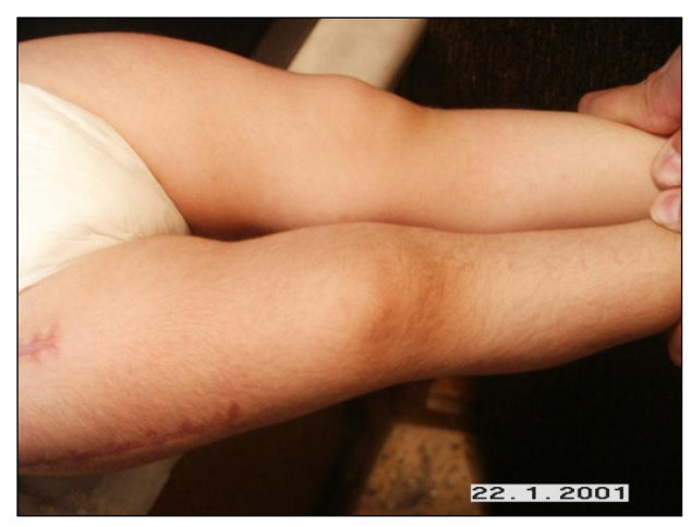
Figure 2. Photograph for female child post management for the right hip coarse skin hair appears in the picture while absent hair on the left lower limb.