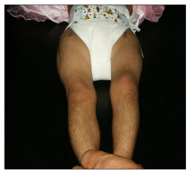
Figure 3. Photography of both lower limbs with clear evidence of abnormal profuse hair growth for female child.