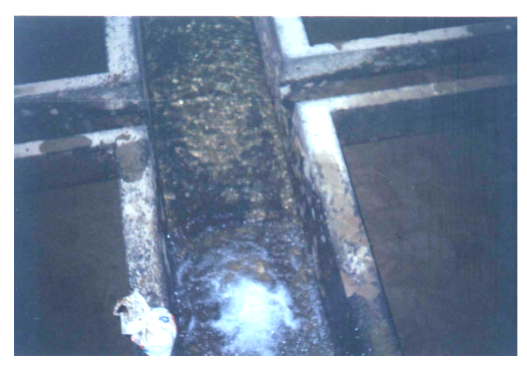
Plate 2: Sand in the Wash Water Trough is an Indication of the Escape of this Material Due to Excessive Air Scour.