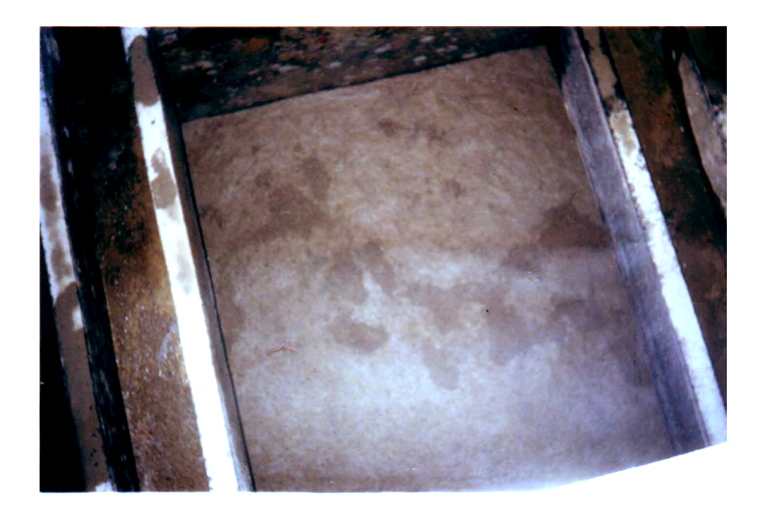
Plate 1: Mounds and Holes in the Filter Bed Suggest Probability of Problems in the Gravel and Under Drains.

Accordingly, the existing system of sand layers and underdrains should be substituted by a new one conforming to authorized recommendations. The new system is preferably assumes the following size and thickness (tables 2 and 3) (WHO, 1969).