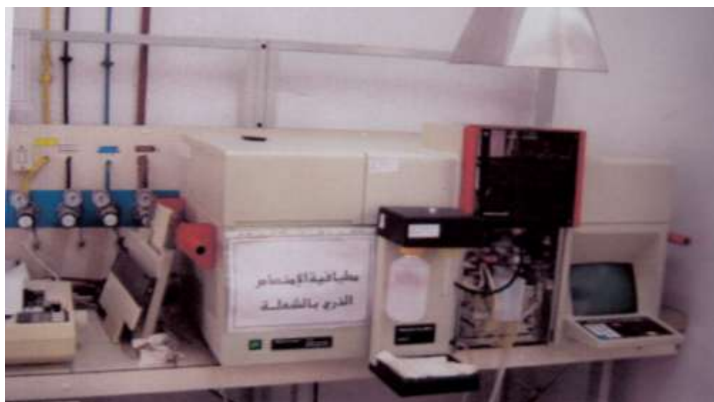
Fig 1 :Atomic absorption machine

For group A: the released mercury in the solution was measured by using of the atomic absorption machine (2004-Japan ),(11),Fig 1.