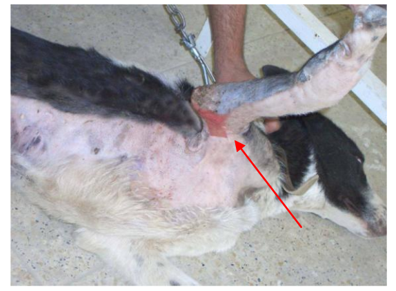
Fig. 10: Showing mini foci of necrosis at the medial aspect of the limb