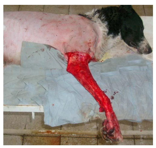
Fig. 5: Showing large naked area after complete debridement and removing of lacerated necrotic tissue.

After complete debridement by removing the necrotic tissue from affected limb the result was a large naked area without skin (Fig. 5). The affected limb in all treated cases was gaining on the new skin from the subcutaneous tunnel (Fig 6). Healing between the limb and trunk skin in all cases was a good union without any complications (Fig. 7). The subcutaneous tunnel in some cases created comprised with few fibers of cutaneous trunkii muscle that's severely adherent to the skin, therefore the limb after healing will appear thicker than a sound one (Fig. 8)