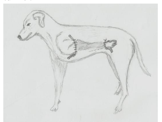
Fig. 3: Showings suturing the stump skin of the limb at the proximal and distal ends with the skin of the trunk at lateral side.