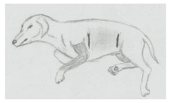
Fig. 1: Showing naked affected limb with incision sites for subcutaneous tunnel.

The protocol for liberation this limb is depended on 2 stages. The first stage begins at 10-15 days after suturing of the limb skin with the trunk skin by partial liberation of this limb from the tunnel at the elbow and carpal joint area only with keeping the rest limb imbedded within the tunnel (Fig. 4). The second stage begins at 10-12 days from the first stage later, in this stage we will separate the whole rest limb from the tunnel, at this time the limb will gain on the new skin taken from the lateral side of the trunk. The edges of the new skin of liberated limb sutured together at the medial aspect by the simple interrupted suture technique with silk No. 1. Finally the wound on the lateral side of the trunk which is recited after liberation the whole limb from tunnel sutured by the same technique that used in the limb.