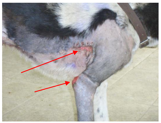
Fig. 9: Showing mini foci of necrosis at the elbow joint area and lateral side of the trunk (donor area) occurred in 2 cases.

Mini foci of necrosis developed in 3 cases within 4-8 days after complete separation of the limb from the tunnel, and then the flap heal and survived after good management and wound dressing (Fig. 9, 10). The other flaps survived successfully, and the incisions healed by first intention without necrosis or ulceration or any other serious complications.