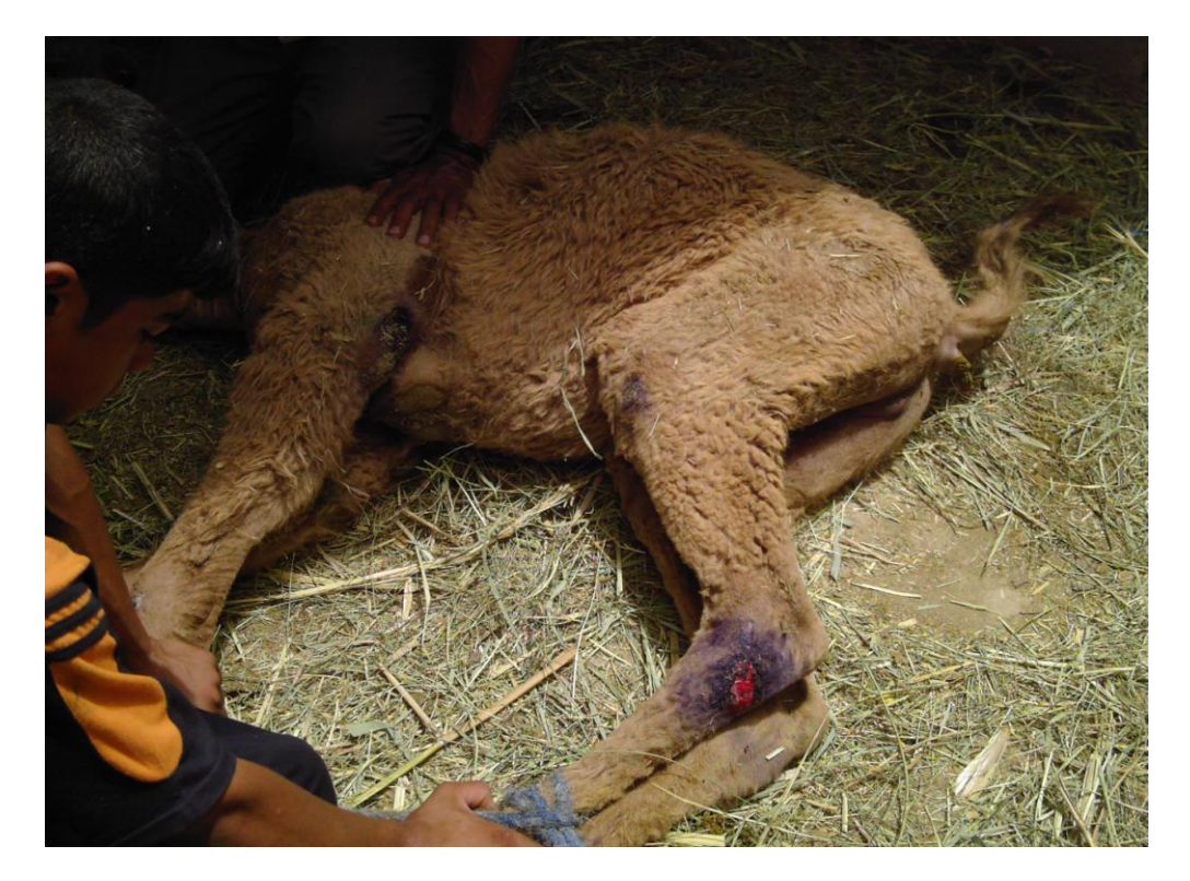
Figure (3): The site of infection in knee joint of camel