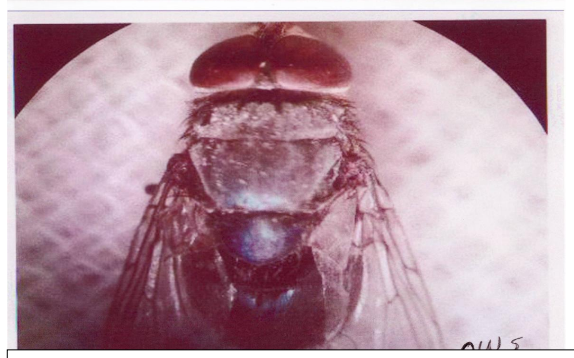
Figure(2): The adult fly of Chrysomya bezziana