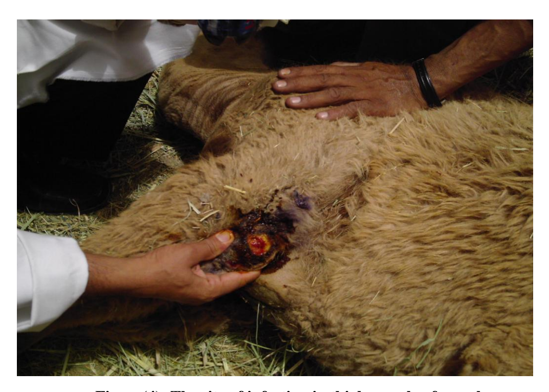
Figure (4): The site of infection in thigh muscle of camel