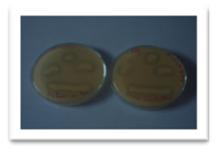
Fig(3) Inhibition zone of Bacillus subtilus against Aeromonas hydrophila after incubated Bacillus 3,4days