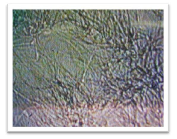
Figure 4: Mice sperms under microscope

Figure 2: Finding the Caudal Epididymis Figure 3: Cutting out the Caudal Epididymis