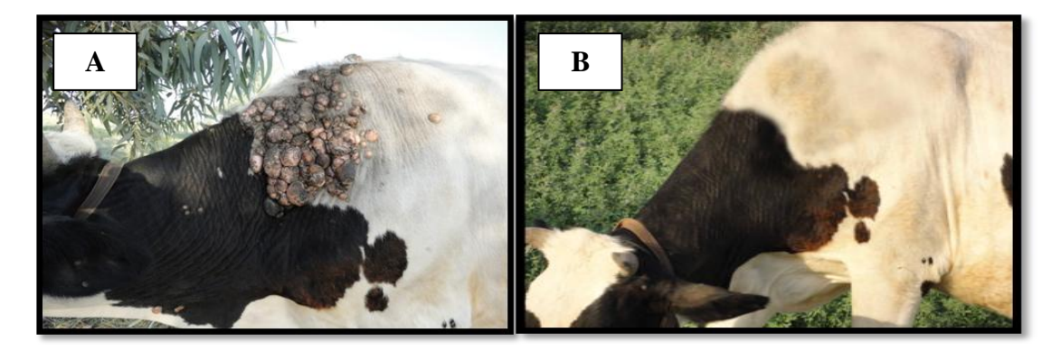
Fig. (1): (A) Shows severe papillomatosis on the front back of cow before treatment and (B) Shows the same cow with complete regression of the warts after 50 days of treatment with autogenous vaccine.