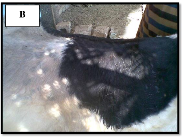
Fig. (2): (A) Showing cow with papillomatosis before treatment and (B) Showing cow with a complete regression of warts after 40 days of treatment with heterogeneous (cell culture) vaccine.