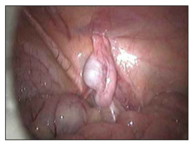
Figure 2. Intra abdominal testis.