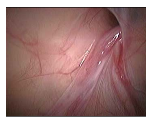
Figure 1. Vas and vessel entering the internal ring.

our patients had inguinal hernia that was evident clinically preoperatively.