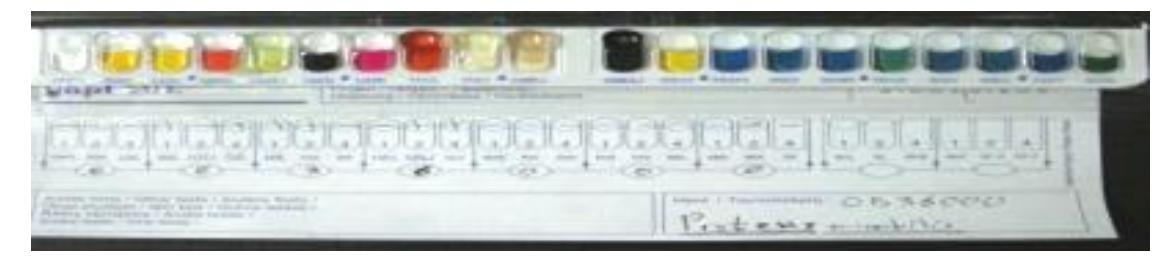
Figure (1) Astrip of Api20E system show the biochemical results of Proteus mirabilis

There were a high resistant rate expressed by the isolates against Tetracycline (81%), and aminoglycoliside antibiotics as Gentamycin 13(75%). So rendering these drugs inactive for treating UTI caused by Proteus mirabilis.