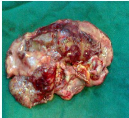
Figure 3: The kidney grossly necrotic seen after nephrectomy.