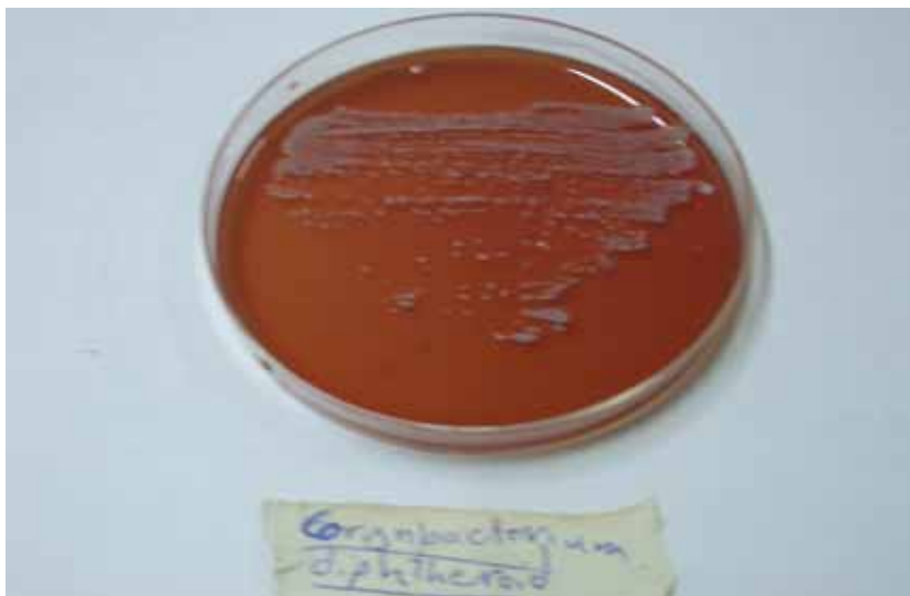
Figure 6: Colonies of Coryne bacterium spp( diphtheroids) on blood agar medium isolated from umbilicus, telescope and peritoneum.