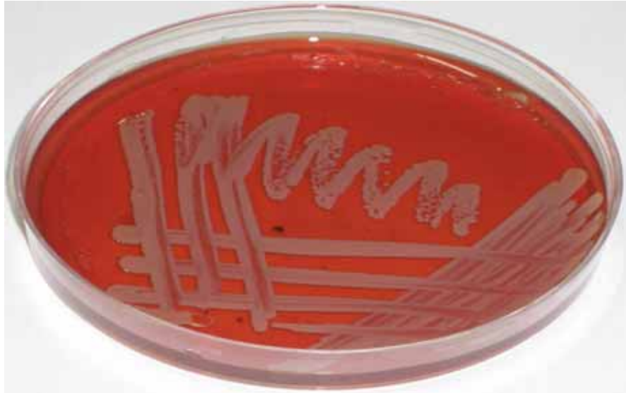
Figure 5: Staphylococcus aureus on blood agar isolated from. peritoneum