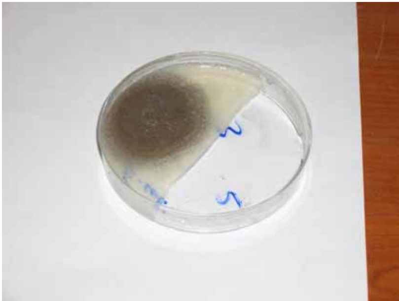
Figure 8: Aspergillus niger on sabouraud glucose agar medium isolated