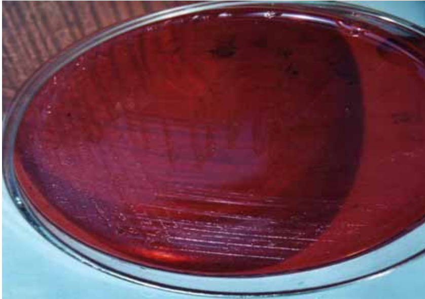
Figure 7: Streptococcus faecalis on MacConkey Agar isolated from umbilicus area.