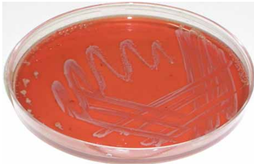
Figure 4 Staphylococcus epidermidis on blood agar isolated from umbilicus, telescope and peritoneum

In case of peritoneal culture, the specific organisms' cultures were similar to the skin Findings. These organisms are probably carried in to the peritoneal cavity by the insufflating gas needle and or trocars rather than by the telescope it self, which was inserted through the sheath after removal of the trocar. This suggested that the peritoneum was being contaminated by skin flora and not by the laparoscope.