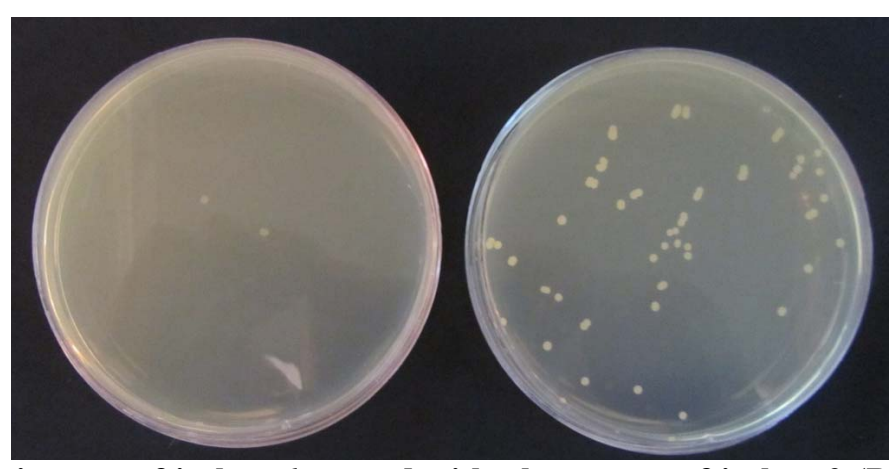
Plate 1: transconjugants of isolate 6 treated with pheromone of isolate 2 (Right plate) and untreated (left plate) on BHI agar containing nalidixic acid and erythromycin.

All transconjugants tested were resistant to erythromycin, cefalexin , gentamycin and nalidixic acid as found in the untreated isolates. Our results are compatible with those of Lim et al. , (2006) as they found that the pheromone responsive plasmids pSL1 and pSL2 isolated from E. faecalis kV1 and kV2 transferred the resistance to vancomycin, gentamycin , kanamycin , streptomycin and erythromycin at a frequency of about 10^{-3} per donor when treated with the filterate of E. faecalis FA-2 culture. The plasmid did not respond to several other synthetic pheromones tested, this may indicate that isolates 1,2,5 and 8 may produce other pheromones that did not induce the transfer of plasmids in the isolates 3,4 and 7 and we can also say that the isolates 3,4 and 7 may had contained another pheromone - responsive plasmid which is not responding to the pheromones isolated from the isolates 1,2,5 and 8. The conjugation frequency of treated isolate 6 was less than this researcher maybe because he used the ratio 1:9 donor/ recipient with the laboratory strain E. faecalis as a recipient strain in conjugation .