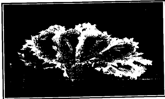
Fig . 1 : photographic representation of a corrosive cast of right renal artery show it's branches in adult sheep .

The branching pattern of interlobar arteries revealed in the present study was agree with that observed by willens and munster (1979) in Ruminant. Concerning of the ureter of the sheep in the present study had revealed that it was slightly large as well urine could normally seen in the renal pelvis , this result was different from results recorded by (5) and from cat recorded by (11). Who revealed that the urine could not normally seen in the renal pelvis because of the small size of ureter in rabbits and cats.