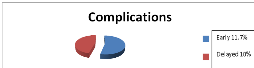
Graph 2: Complication rate in early and delayed groups