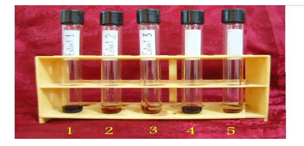
Figure 1 : Cytotoxicity of aqueous and ethanolic extract for Suaeda sp. against red blood cells : 1 – Hot aqueous extract. 2 - Hot ethanolic extract. 3 – Cold ethanolic extract. 4 – Tap water. 5 – Normal saline.

( - ) = No Lysis . ( + )= Hemolysis is found.