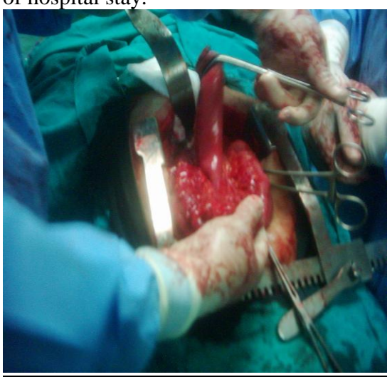
Figure 3: The retrocolic Roux limb.

general but it did affect the mean duration of hospital stay.