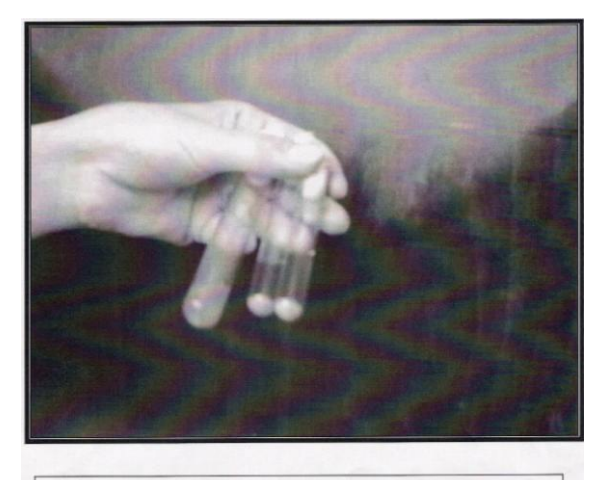
Plate (2) Precipitates represent quantities of Sialic acid and Lipotechoic acid in the cell wall of S.agalactiae