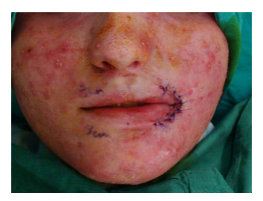
(B) Vermillion Advancement