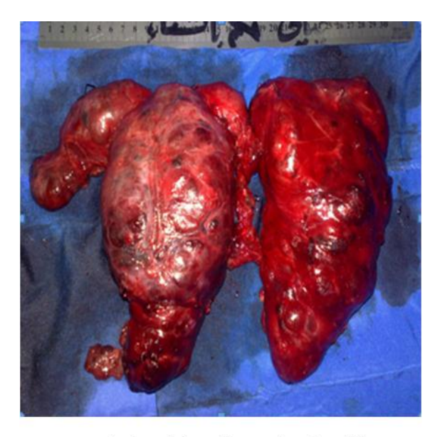
Figure-4-The thyroid specimen after thyroidectomy

Two thyroid tissues ; each was about 14x10x7 cm, grey brown in color, nodular with colloid, heamorrhage and calcification.