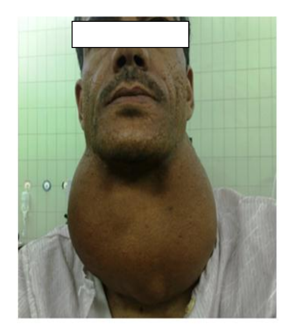
Figure-2-Pendred's Syndrome before thyroidectomy

36 years old unmarried male (Figures 2 and 3) presented to our hospital with history of deafness and mutism since early childhood, followed by gradually increasing goiter in adulthood causing progressive dyspnea and difficulty in sleep. Physical examination revealed big multinodular goiter occupying the anterior and lateral compartments of the neck with poscillated thyroid surface and prominent isthmus. The goiter was not tender, nor bruit was found on auscultation. Thyroid function test showed euthyroid state. Other blood investigations were normal. Ultrasound examination confirmed multinodularty. Indirect laryngoscopy confirmed mobile both vocal cords. A written informed consent was obtained from the patient and his family for publication of this case with its accompanying images. Operation was performed under general anesthesia with endotracheal tube. One pint of compatible blood was transfused during operation. Total thyroidectomy was performed (Figure-4) and the patient had smooth postoperative period. The patient was postoperatively kept on perminant replacement therapy with Thyroxin (100 micg tablets) one tablet/ day.