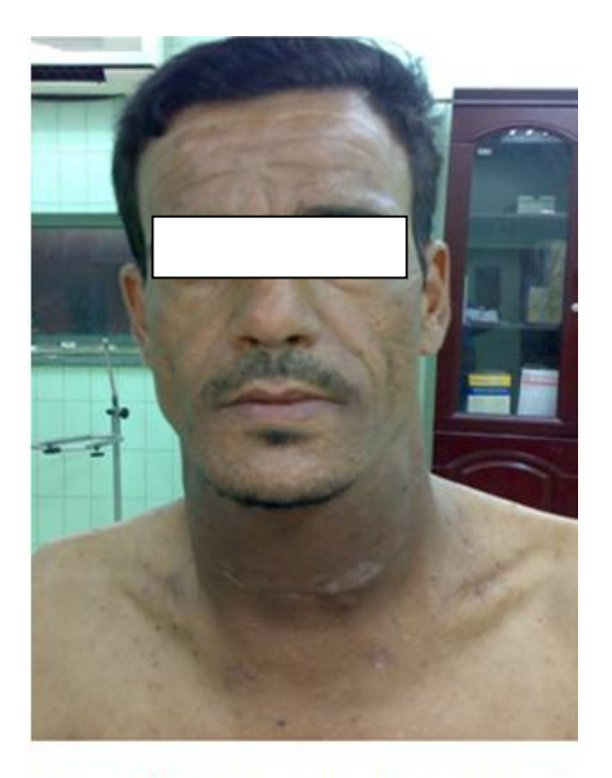
Figure-3-Pendred'Syndrome after thyroidectomy