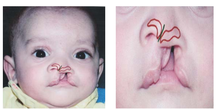
Figure 1: Three months old baby with left complete cleft lip and palate, the pictures shows clearly most of the anatomical changes in lip and nose. Alar cartilages were drawn in red and the intervening oblique green line represents the septum and how it is clearly deviated towards the noncleft side.