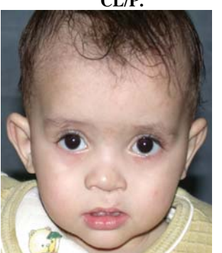
C: Six months postoperatively.