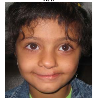
D: Acceptable result 5 years postoperatively.

Figure 9: A: Three months old baby with left complete CL/P.B: Three weeks postoperative view shows a well suspended alar cartilage .C and D: Five years postoperative worm eye view shows a well projected nasal tip but there is a mild drooping of the suspended alar cartilage causing a mild nostril asymmetry. The result is considered as acceptable.