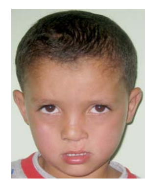
D: Five years postoperatively.

Figure 4: Same baby in figure 1, good result. All the 4 evaluation parameters achieved.