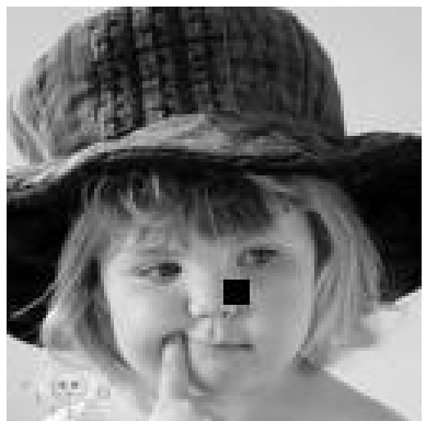
Fig. 4.1 Child image

Assumed that the neighboring child image is an applied example, whereas this image of type of grayscale with extension of BMP and size 128 \times 128 , wanted curing the concealment 8 \times 8 block by applying the proposed methods.