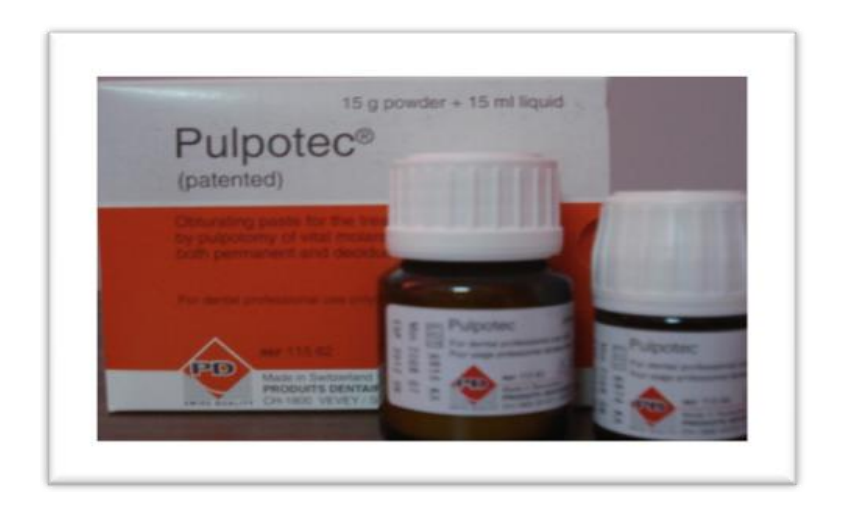
Figure (1): Pulpotec® obturating paste (Produits Dentaires S.A., Switzerland) used in this study.

Pulpotec<sup>®</sup> obturating paste (Produits Dentaires S.A., Switzerland) is radiopaque, non resorbable paste for the treatment of pulpitis by pulpotomy in vital molars, both permanent and deciduous. It manufactured in form of powder (polyoxymethylene, iodoform, excipient) and liquid (dexamethasone acetate, formaldehyde, phenol, guaiacol, excipient) (Figure 1).