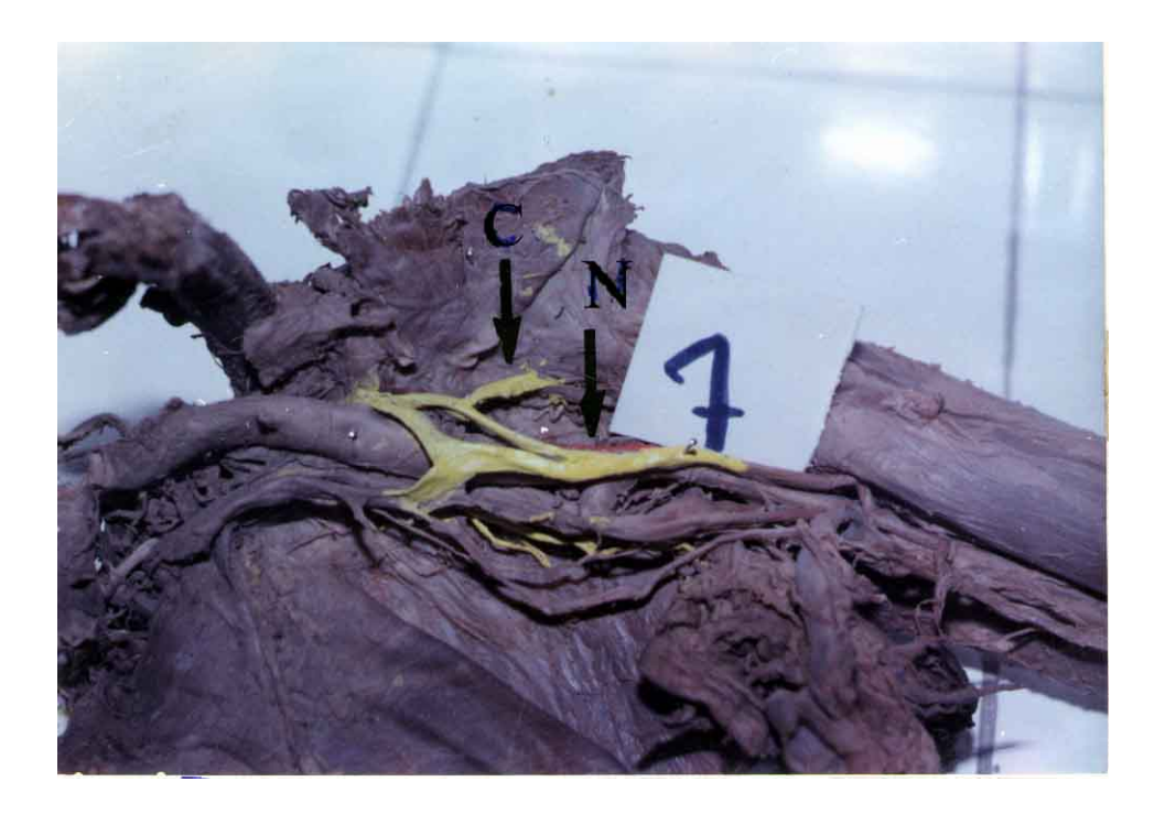
Fig.1: Showing the bundles of fibres carried by musculocutaneous nerve (C) which later join the madian nerve (N) at low level in the brachiam.

The musculocutaneous nerve presents frequent variations (Bergman et al..., 1985; Williams & Warwick, 1989). The present study shows that in 3 cases (5%) a musculocutaneous trunk containing fibres destined to join the median nerve; these fibres were given off in a bundle to join the median nerve at a variable distance down the arm (see Fig. 1), similar observation has been reported before. (Bergman et al.., 1984). On the other hand 1-2 muscular branches were reported to be given off to coracobrachials muscle by the musculocutaneous nerve close to its formation. (Woodburn, 1983).