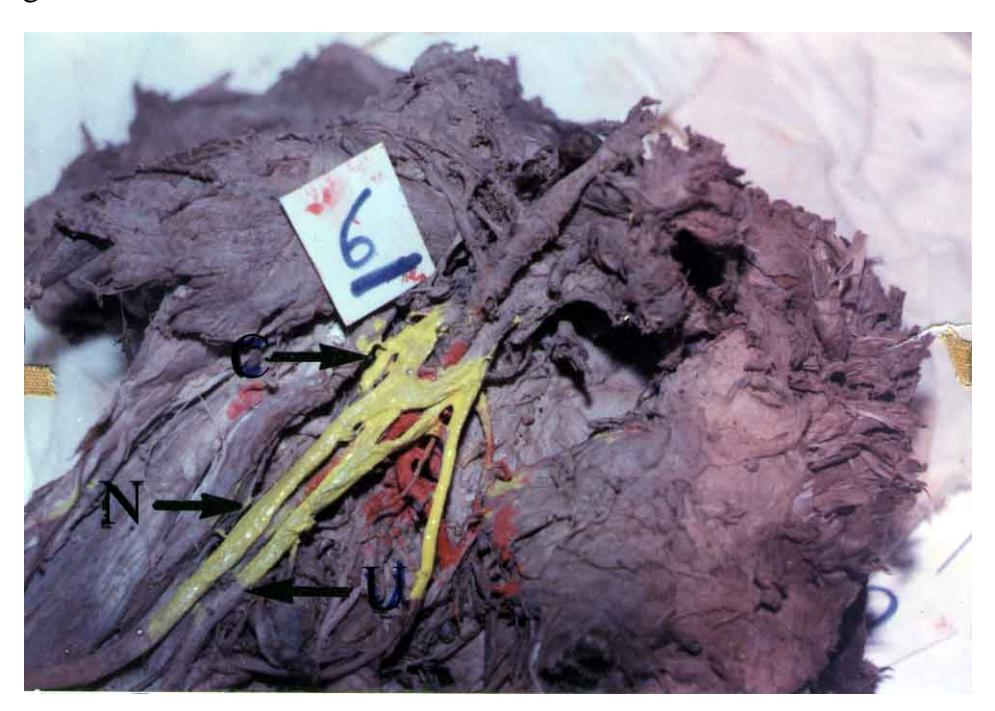
Fig.2: Showing ulnar nerve (U) formed by two roots, first root from medial cord and second root from lateral cord, median nerve (N) and musculocutaneous nerve (C).

The ulnar nerve is normally derived from the medial cord (Woodburn, 1983), but occasionally the ulnar nerve obtains fibres from the seventh cervical root by means of a communication established between it and the lateral root of the median nerve. (Linel, 1921). In 2 cases (3.7%) of this study the ulnar nerve was formed by the union of two roots, one root from the lateral cord with a second root from the medial cord (Fig. 2). To the best of our knowledge this variation has not been reported by any previous investigators.