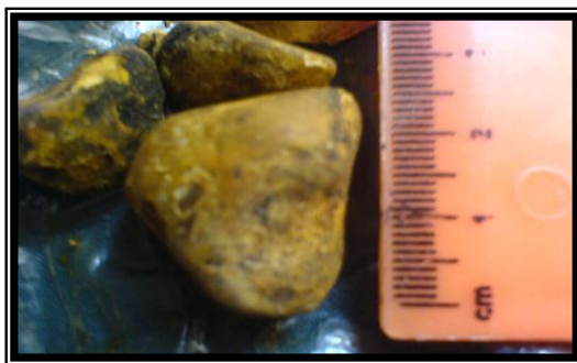
Figure 4: Gallstone more than 2.5 in diameter.

In 19 patients with gallstones (14%), two different sizes of gallstones were found in the same gallbladder and in seven patients (5.2%), three groups of gallstones of different size were identified in the same gall bladder and in one patient (0.7%), four different groups of gallstones according to the size were found.