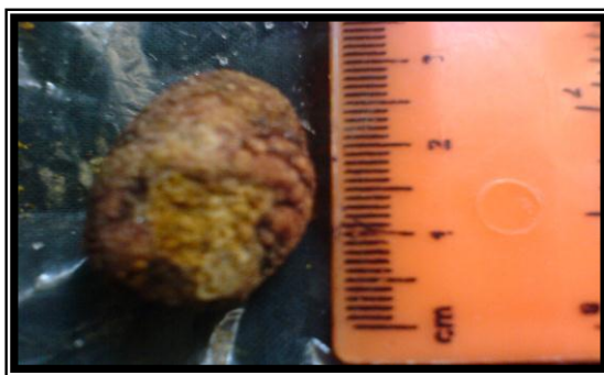
Figure 1: Solitary stone.

As to the size of stones, it ranges from less than 0.5 cm in 35 patients (25.7%), up to > 3 cms in four patients (2.8%). (Figure “4”) & (Table 3)