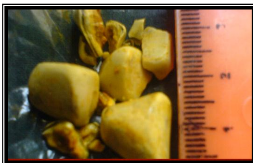
Figure 2: Gall stones less than 10 in number.

As to the size of stones, it ranges from less than 0.5 cm in 35 patients (25.7%), up to > 3 cms in four patients (2.8%). (Figure “4”) & (Table 3)