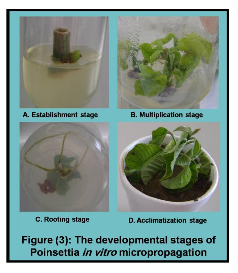
Figure (<sup>r</sup>) shows the different developmental stages of poinsettia micro propagation including establishment stage (A), shoot multiplication stage (B), root formation stage (C) and acclimatization or hardening-off stage (D).

Well developed plantlets were successfully transplanted to the out-air conditions with 4 \cdot \% survival showing normal features without any morphological variation. The results achieved here, demonstrate successful and reproducible colonial propagation protocol of Euphorbia pulcherrima Willd. leading to commercial mass production.